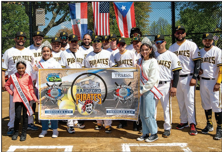
On Sunday, May 7, Amigos Softball League kicked off another season at Colt Park. With 16 teams, the league is one of the largest in Connecticut. The highlight of the opening day festivities was the naming of the winners of the Best Uniforms competition. The Pirates (above) won first place.