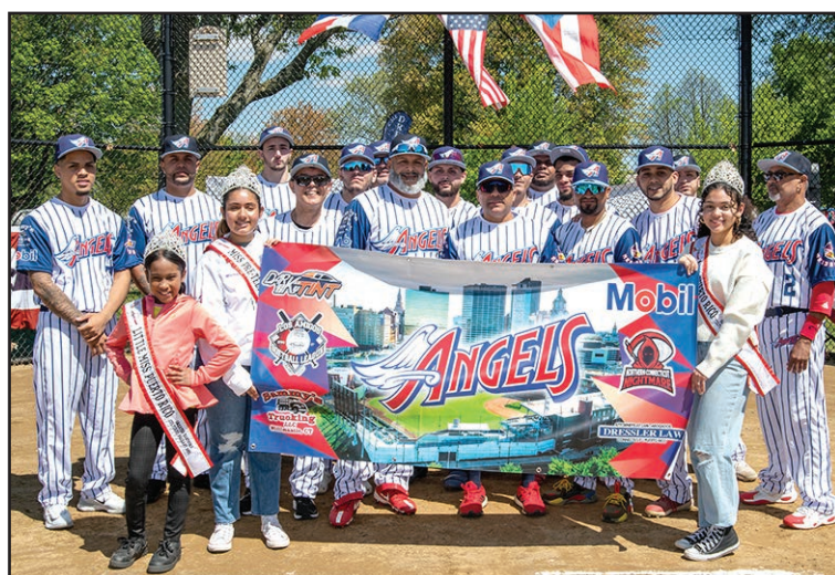
Best Uniforms, 2nd Place: The Angels