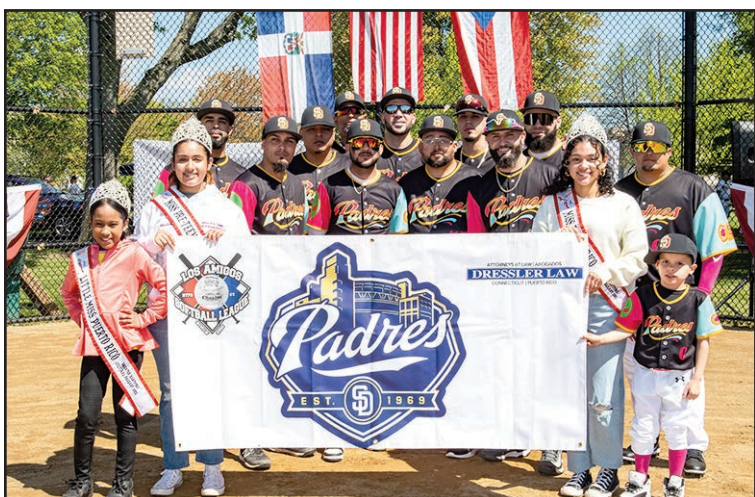
Best Uniforms, 3rd Place: The Padres